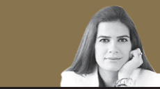
NATASA PILIDES Shipping Deputy Minister, Republic of Cyprus