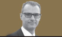
CONSTANTINOS HERODOTOU Central Bank of Cyprus