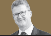
STEPHEN LILLIE British High Commissioner to Cyprus