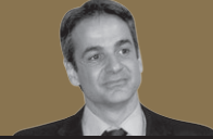
KYRIAKOS MITSOTAKIS New Democracy Party, Greece