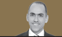
HARRIS GEORGIADES Minister of Finance, Republic of Cyprus