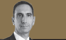
CONSTANTINOS IOANNOU Minister of Health, Republic of Cyprus