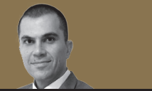
SAVVAS PERDIOS Deputy Minister of Tourism, Republic of Cyprus