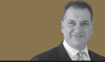
GEORGE LAKKOTRYPIS Minister of Energy, Commerce & Industry, Republic of Cyprus